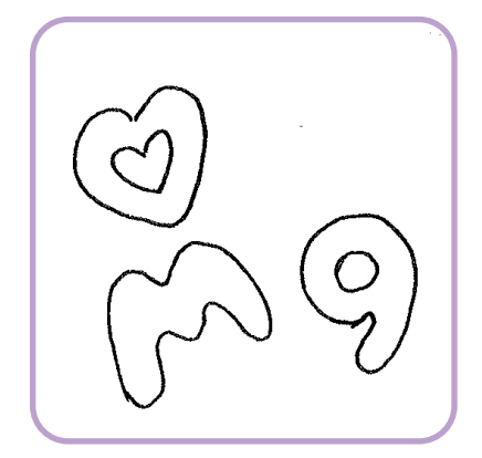
Use coils to add letters, numbers, or shapes. Don't forget to scratch and attach!